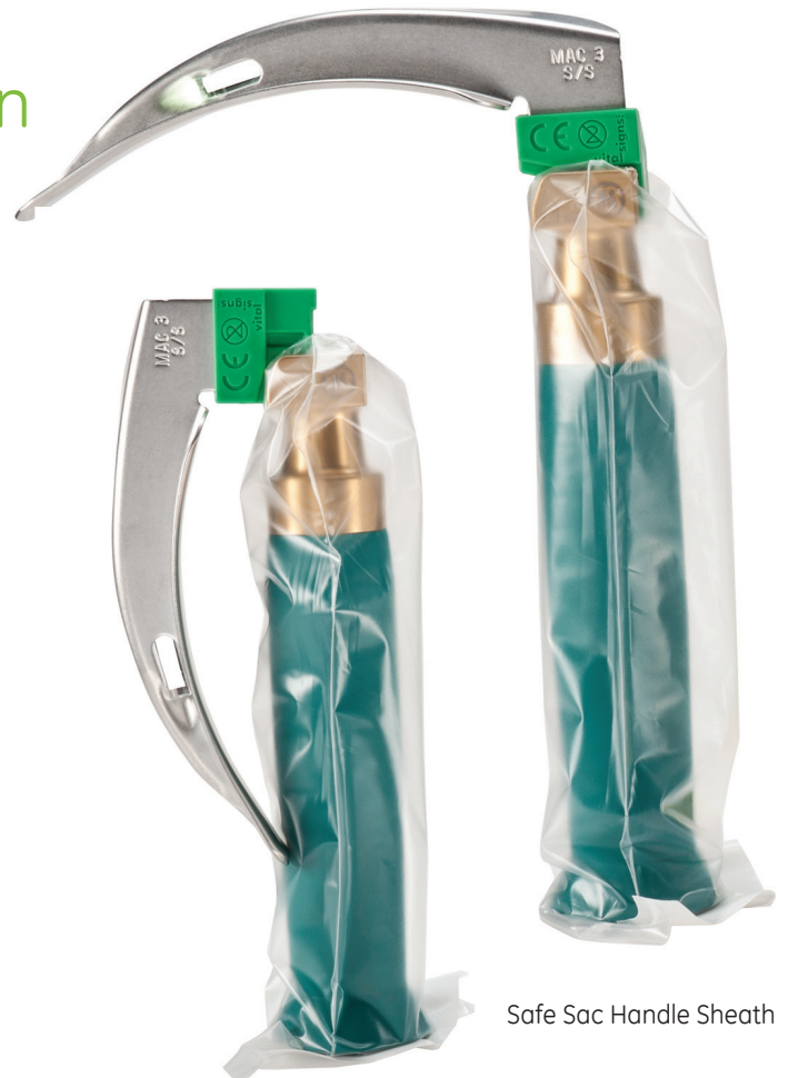
Safe Sac Handle Sheath