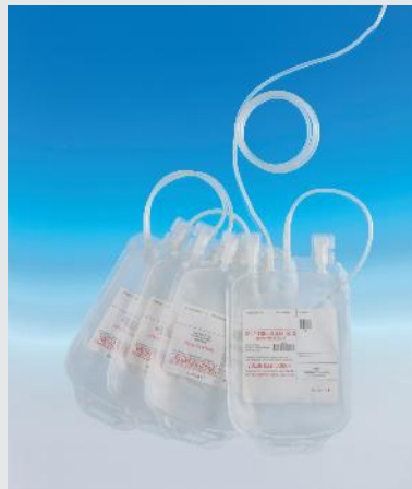
Reorder code: 136-94, CPDA-1 Quad

A closed system for the collection and pre-storage leukoreduction of one unit of whole blood and the subsequent storage of the red blood cell and plasma components. Platelet concentrates cannot be made, as platelets are removed by the filter.