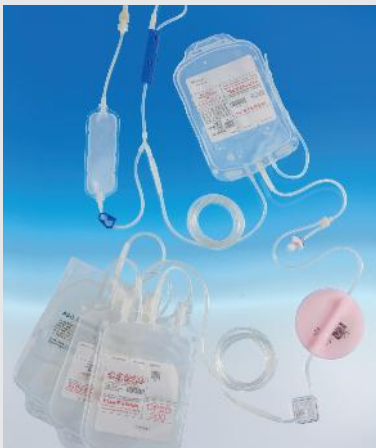
Reorder code: 126-92, CP2D/AS-3 Double