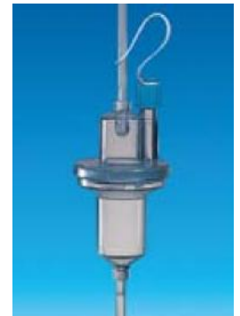
Self Levelling Drip Chamber